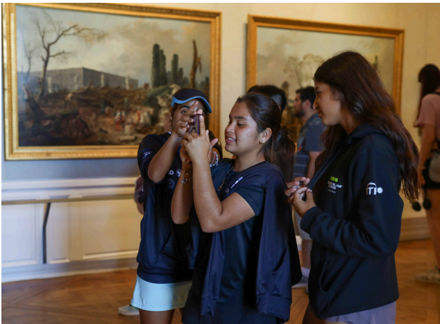
Visit to the Palace of Versailles